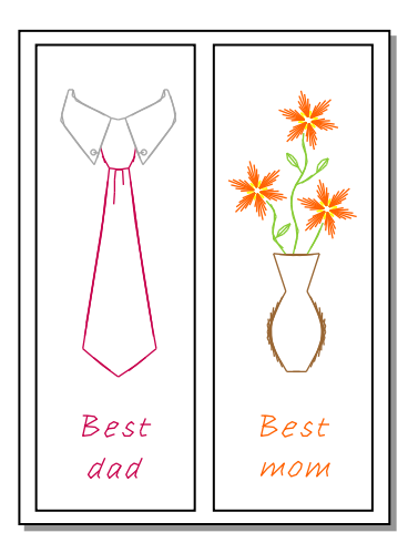
FT058 Bookmarks #4 Code B

Thank you also for all the sales on the designs contributing towards the Australia wildfire fund, which we have mentioned in our previous newsletter. Although the original website we have mentioned was no longer available, we still donated the money to the Official WWF-Australia (https://donate.wwf.org.au)