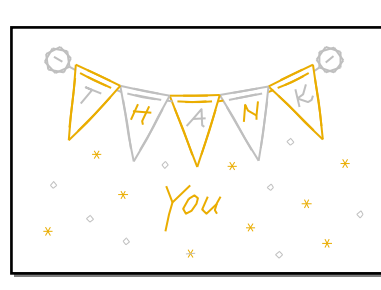
C052 Bunting Wishes Code B