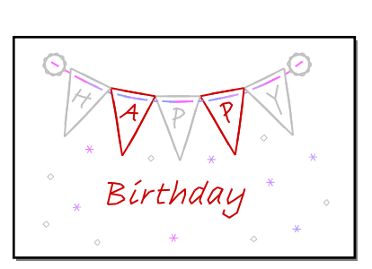
C052 Bunting Wishes Code B

Pricking - 15 minutes, Stitching - approx. 1,5 hours