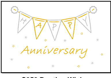
C052 Bunting Wishes Code B