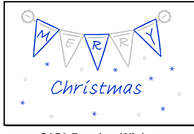
C052 Bunting Wishes Code B

It is easier to see the holes/pricking on a dark card when you have a white "background" underneath the card. A piece of printer paper will do. Likewise, it's easier to see the pricking on a light/white card when you have a dark background underneath the card.