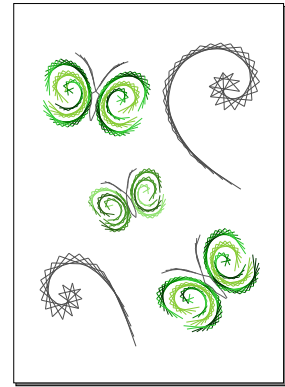
F052 Butterflies Code B